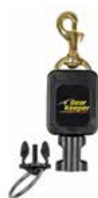
■ Mini GK Console Brass Bolt ($24.99) RT4-5983 Brass Bolt