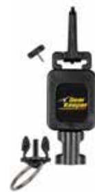
■ Mini GK Console Combo Mount ($21.99) RT4-5973 Snap/Threaded Stud

Combo Mount: Includes two mounting systems in one package. Allows for the most versatile gear configuration