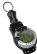
■ SUUNTO Universal Retractable Computer Bracket ($44.99) 1-0148-03 Works with Vyec - Vyper - Gekko Favor/Fusion - Solution Series Companion - Octopus 2 Does not include computer