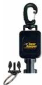
■ Mini GK Console ($21.99) RT4-5913 HD Snap Clip

Snap Clip Mount is the most common version. Easily connects to D-ring of BC Large SS gate rotating Snap Clip attaches to the large BC D-rings