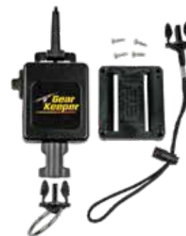
■ Locking GK Deluxe ($29.99) RT3-5912 Snap/Bracket

Locking Flashlight Retractors Force: 12 oz. Extension : 42" Lights 3C to 8D, Rechargeables & Cameras