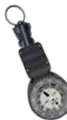
■ SUUNTO SK7/SK8 Retractable Compass Bracket Assembly ($44.99) 1-0104-03 Works with Hose Mount SUUNTO Compass Boot Does not include compass module