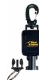
■ Mini GK Flashlight ($20.99) RT4-5912 HD Snap Clip

Snap Clip Mount is the most common version. Easily connects to D-ring of BC Large SS gate rotating Snap Clip attaches to the large BC D-rings