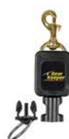
■ Mini GK Flashlight ($24.99) RT4-5984 Brass Bolt

Snap Clip Mount is the most common version. Easily connects to D-ring of BC Large SS gate rotating Snap Clip attaches to the large BC D-rings