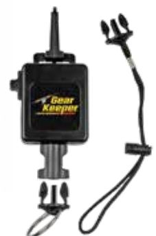
■ Locking GK Deluxe ($28.49) RT3-5913 Snap Clip

Locking Console Retractors Force: 24 oz. Extension : 32" For Attaching Console at Waist or Chest