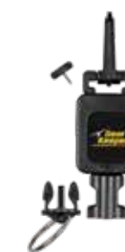
■ Mini GK Flashlight Combo Mount ($20.99) RT4-5972 Combo Snap/ Threaded Stud

Combo Mount: Includes two mounting systems in one package. Allows for the most versatile gear configuration