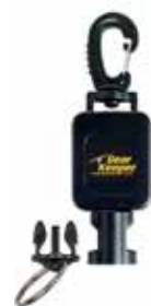
■ Mini GK Flashlight ($20.99) RT4-5914 HD Snap Clip

Medium Flashlight Retractor Force: 16 oz. Extension : 22" Lights 3C to 8AA