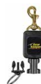
■ Mini GK Flashlight ($24.99) RT4-5982 Brass Bolt