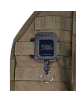
360° Rotating MOLLE Mount Minimizes gear movement

Rotation Minimizes resistance & maximizes line life