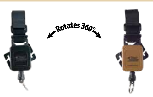
Combo MOLLE Mount ($25.99) RT4-5170 Force: 3 oz Ext: 36" RT4-5171 Force: 6 oz Ext: 36" RT4-5174 Force: 9 oz Ext: 32"

Rotation Minimizes resistance & maximizes line life